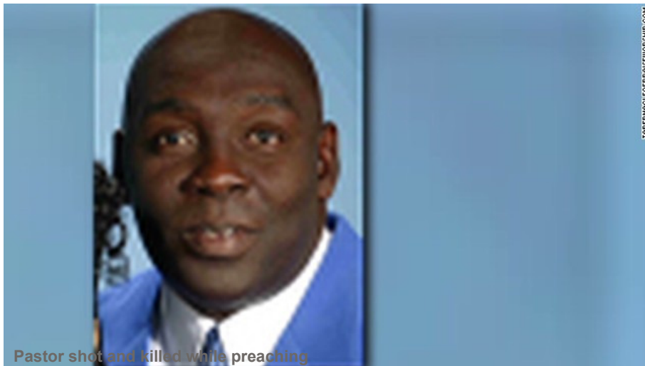
Pastor shot and killed while preaching