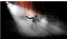
The Week in Pictures