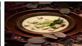
Photos: Chicken soup or stew in an hour or less