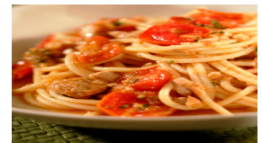
Four low-calorie, fast pasta recipes

Terms of Service | Privacy Policy | Los Angeles Times, 202 West 1st Street, Los Angeles, California, 90012 | Copyright 2013