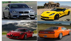
Photos : Top 10 future collector cars for 2014