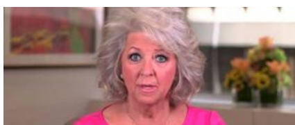
Paula Deen's Net Worth: How Much Did the N-Word and Blatant Racism Cause Her Career?

(https://shareaholic.com/publishers/recommendations/?src=relatedapp&src_ref=www.atoast2wealth.com)