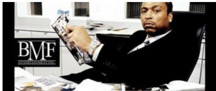
Black Mafia Family Documentary Trailer: "The Rise And Fall of A Hip Hop Drug Empire"