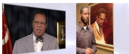
Louis Farrakhan Speaks Out on Sudden Death of Malcolm Shabazz [VIDEO]