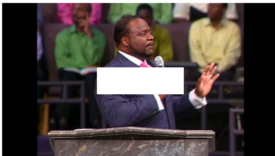
Fourth complaint pending against Long