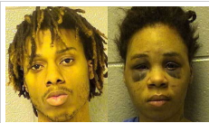
Prosecutors: Mom, boyfriend beat, killed child, made up kidnapping story