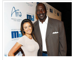
Michael Jordan marries longtime girlfriend