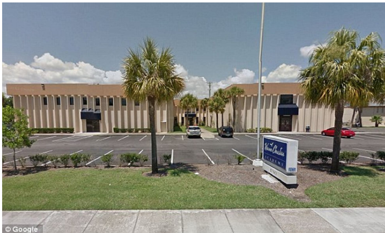
School: The teacher worked at Warner Christian Academy, pictured, in Edgewater