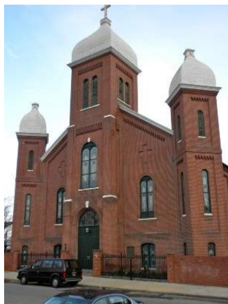
St. Mary of the Immaculate Conception Church

WILMINGTON -- A Roman Catholic pastor of two city parishes -- including one that counted Vice President Joe Biden as a past congregant -- is being accused of embezzling more than $350,000 from the parishes.