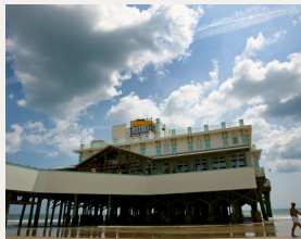
Daytona Pier reopens with Joe's Crab Shack