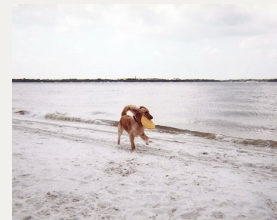
Florida's got beaches for dog day afternoons